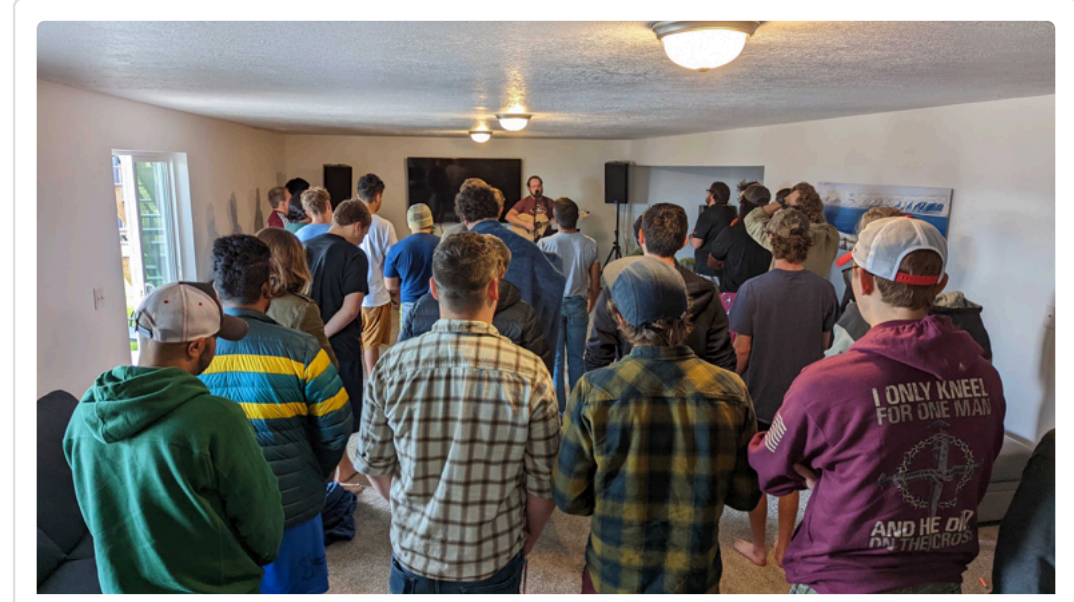
Photo from worship at men's retreat.

A few months ago, one of my roommates and I decided to attend CSU Chi Alpha's men's retreat. We travelled to Bear Lake in Utah and met a couple of old friends from CSU and road tripped all together. It was a lot of fun to see them and catch up with them on the way there and back. While we were there, we all had a really fun time and it was awesome to see and catch up with some old friends and small group members who I hadn't seen in a long time. It was definitely refreshing and a good reminder of what we are trying to build here at CU.