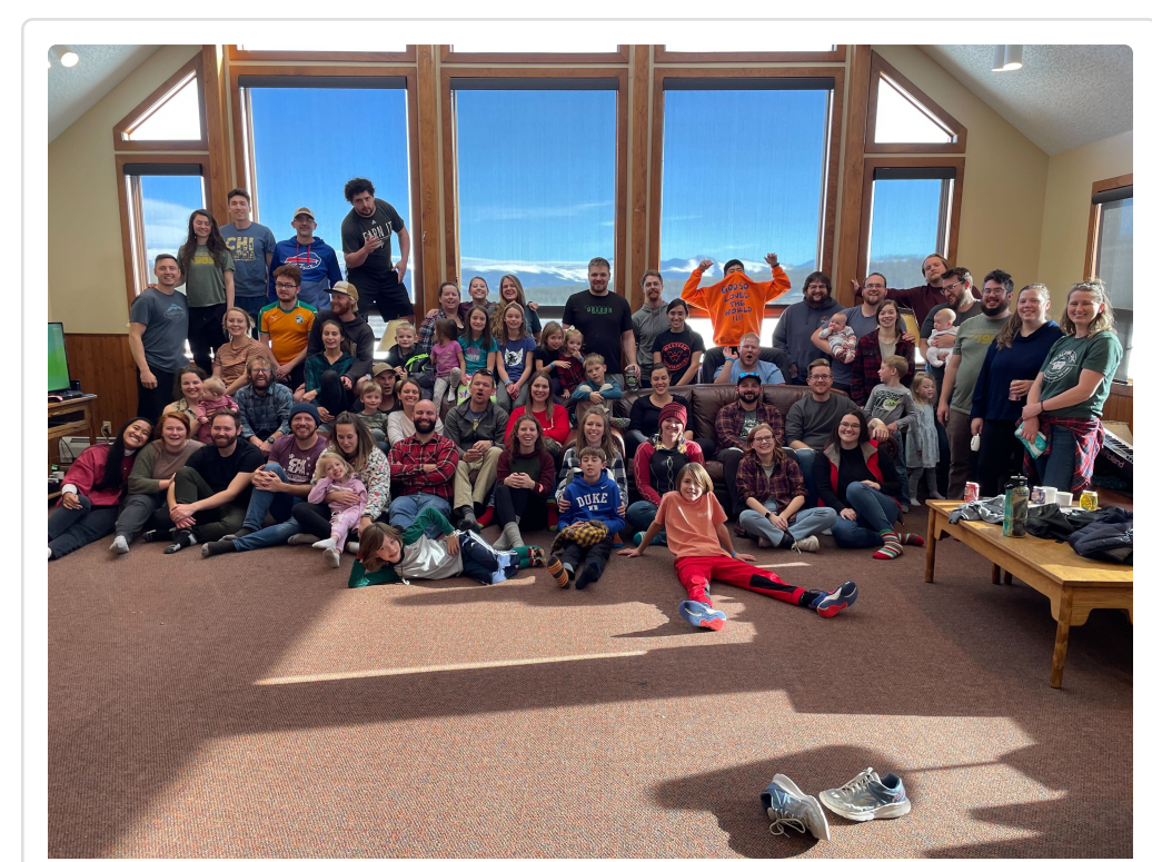
Group photo of everyone at WYCO.

The highlight for me from small group this semester was a dinner that we all had together toward the end of the semester. I really enjoyed this, because it was just an awesome evening of hanging out. After we had dinner, we just hung out together and were doing bottle flips for a while, and then we went and played some basketball on campus and were just genuinely enjoying each other's company. It was the first time that the small group started to feel like more than just a meeting. The small group started to feel like real a community and like brotherhood was forming between everyone! It was a cool glimpse into the potential that the group has and of what we are trying to do and grow here at CU.