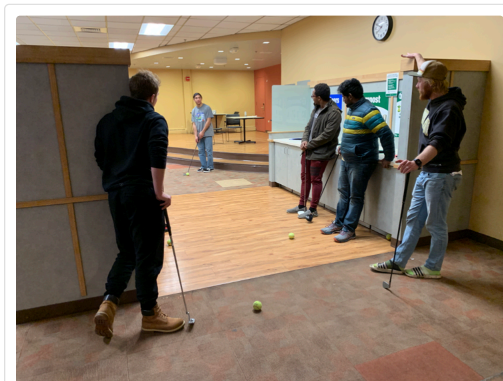
Playing Campus Golf at CU for small group.

After the conference the semester started and has been great so far. This semester, we have continued with our small groups which have been a lot of fun and going well. We are doing a combined guys and girls small group once a month and earlier in the month, when we had it, we had a good amount of students attend. We had a great discussion on the grace of God.