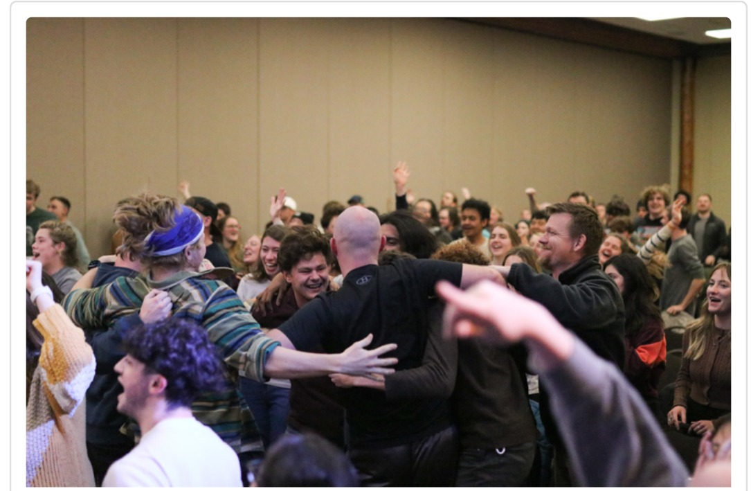
Photo of a worship session at Salt.