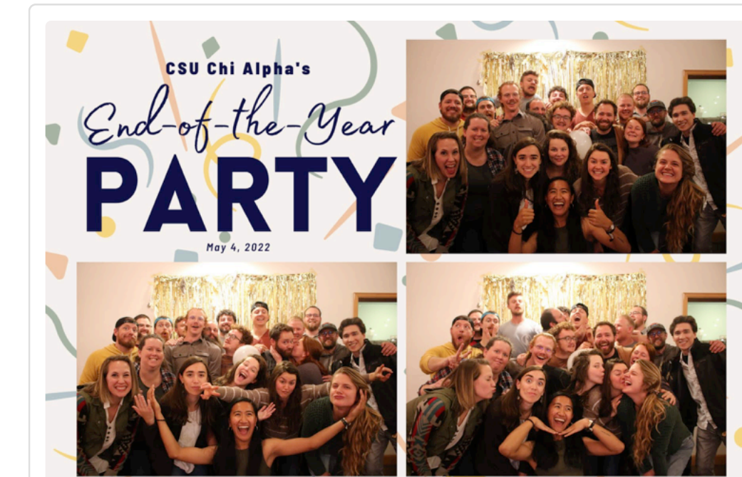
The staff team at CSU Chi Alpha this year!

In May, I officially completed my Campus Missionary in Training internship for Chi Alpha! This took a lot of work and was admittedly very stressful and challenging at times, but God was faithful through it all and it definitely led me closer to Him. I gained a lot of great experience for Ministry and for living life. While it was really one of the more challenging things that I have done, it feels really great to have finished it. I simply cannot thank you enough for your support and prayer during this amazing time of learning in my life.