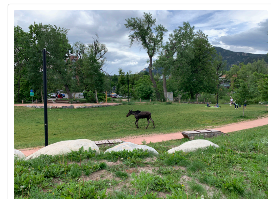
I do not have many photos from Boulder yet, but I was there a couple weeks ago and saw a baby moose that had wandered into one of the parks there. It is a really pretty and interesting town.

With the end of the semester, also came the end of my time here at CSU. This was a bit of a bittersweet moment for me. This is because I have been in Fort Collins for the past 9 years and have been part of CSU Chi Alpha for the last 8 years. So, it is really hard to move on from here and go to Boulder. I am going to miss the friends and brothers that I have made here a ton and I think, when I officially move to Boulder here in the next month or so, things are really going to set in for me that my time here is completed. I know that this is something that God is calling me to do and I am actually excited to be going to Boulder and starting a Chi Alpha there with some of my best friends and closest brothers. I am also looking forward to what this next season of my life in Boulder is going to entail, and the awesome things that God is going to do there!