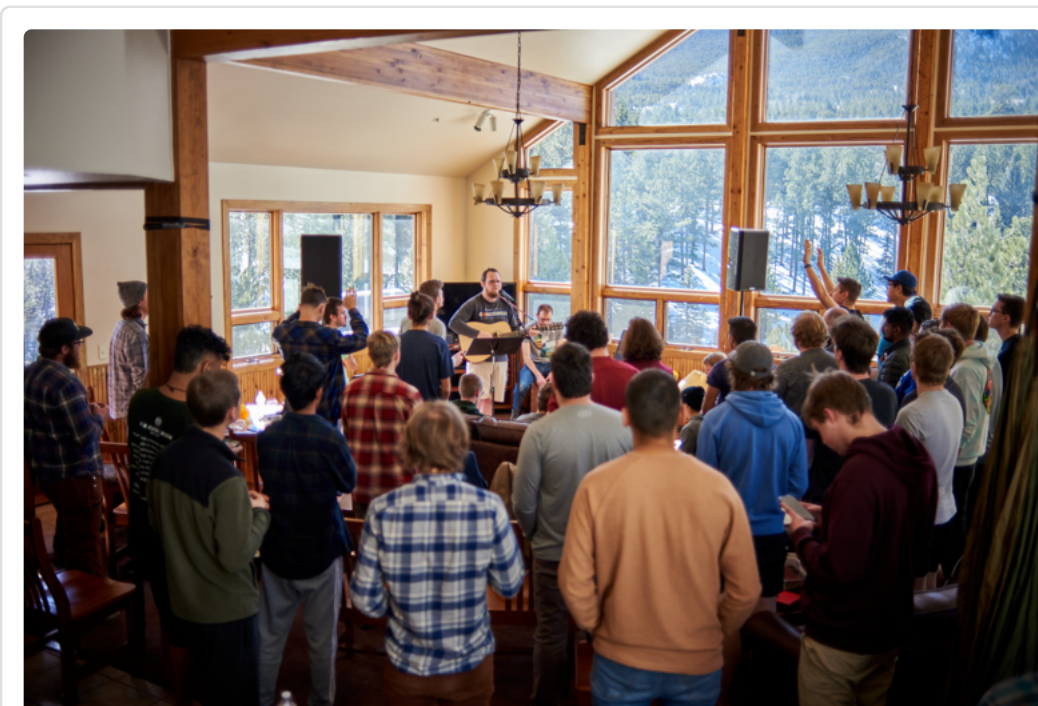
Our 2022 Men's retreat!

I hope the past few months has been good for you all!