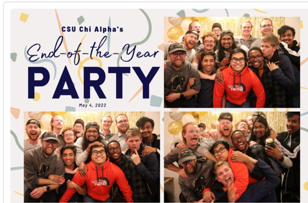
Me and a bunch of guys from my cohort group this year.