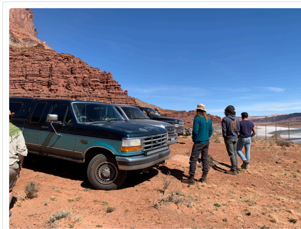
Hanging out in Moab!

some other guys from the ministry for a few days over CSU's spring break. This was a really awesome few days with some great conversations around the campfire and a lot of fun fellowship activities. I had never been to Moab before, so I wasn't really sure what to expect, but it was an awesome week and it was definitely great for getting to know each of the guys that came a little better.