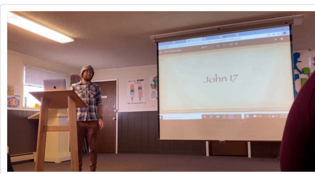
Me giving the sermon.

Texas A&M. He gave a really powerful series of messages about the parable of the sower and the four soils in Luke 8: 4-15. It was a really awesome weekend with a lot of brotherhood forming. Several people gave their lives to Jesus and gave up some things in their lives that had been holding back their walk with God.