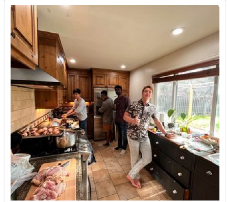
The guy's small group busy cooking a fancy dinner for the girls small group for the final small group meeting of the semester.

One of the main highlights of the semester was having and completing our first Discipleship Training Class. This is a class for training students who are wanting to lead a small group next year or who want to grow in disciple making. The students learn about practical tools/tips on how to go about making disciples. Basically the goal of the class is to equip students with the skills they need to lead a small group, and to set them up for a life of disciple making after college, regardless of where they go or what they do.