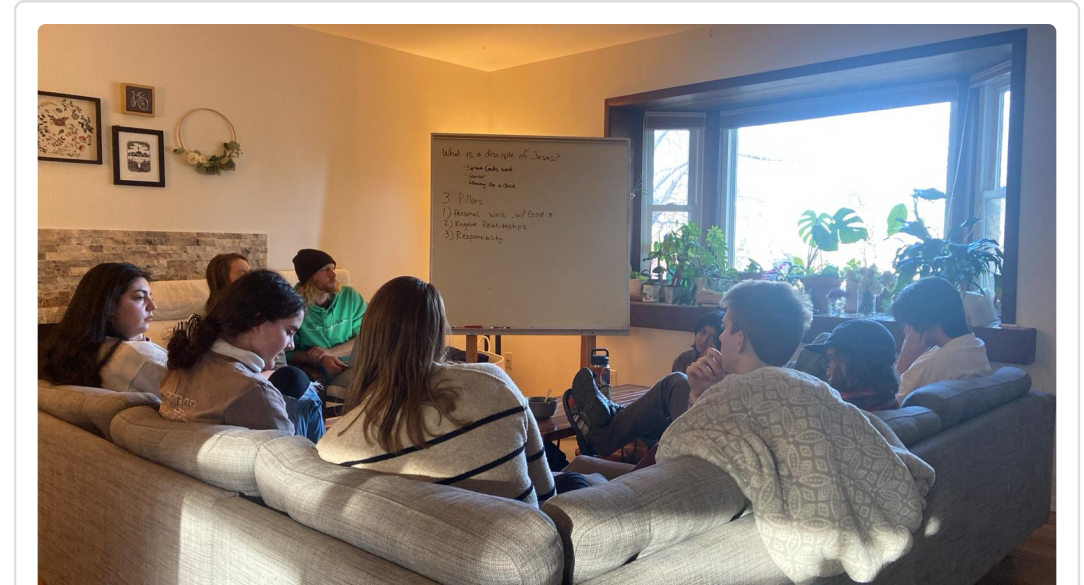
Photo of one of our Discipleship Training Classes.

One of the main highlights from this Spring 2024 semester was doing our second year of our Discipleship Training Class (DTC). This year, DTC was a 7-week class for students that either have a desire to lead a small group of their own and/or who just want to grow in their skills and ability to make disciples in college and beyond that. This year, we had 6 students take the class and it was a really good class! Something we added to the class this year was a retreat for the students as part of the the last classes and this was a lot of fun. We had a couple that we know generously let us use their beautiful AirBnB in Estes Park for the retreat at no cost, and it was a great opportunity for the students in the class to connect more and get to know each other better. It was a great way to end a great class. Overall, The students asked good questions and the discussions were really powerful. I think all of the students really enjoyed the class and got a lot out of it. We will have at least 4 of the students joining our leadership team next year!