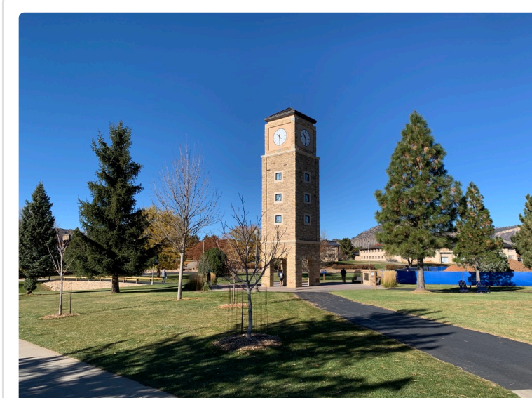
Fort Lewis' iconic clock tower in the middle of campus. We met a lot of students there .

I hope you all had a great Thanksgiving and were able to spend time with friends and family. Thanks a ton for all your support it really means a lot!