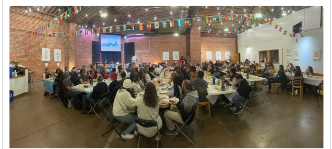
International Agapē Feast!

After Agapē Feast, we had a missions dig in later in the week. A couple that is connected with the community came and spoke on the value of going and doing missions, short term or long term, after college and the skills that they were able to develop. They talked about the relationships and lives that they changed as a result of their time in missions overseas after college, as well as the struggles and obstacles they had to overcome. They also encouraged anyone who may be on the fence about whether to go on mission - that sometimes it's best to just go and trust that God will show up and honor your willingness to go.