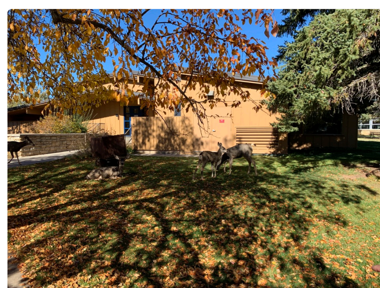
There were deer everywhere on Fort Lewis' campus. Kind of cool to see them and it was a beautiful campus.