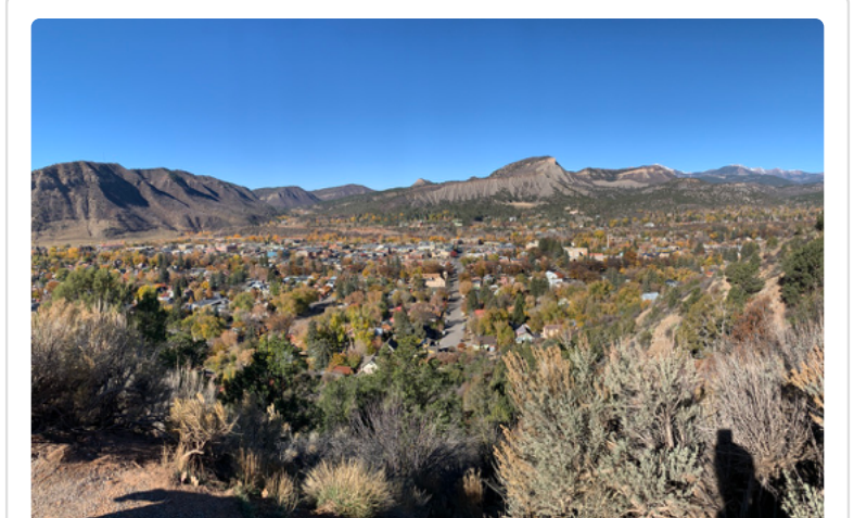
The town of Durango, CO. The college overlooks it.

Two other interns and I started our final project, as well, which is a 5 year pioneering plan to plant a Chi Alpha at a university in CO that currently does not have one. My group chose to do Fort Lewis College in Durango, CO. So, we went and visited the campus and surveyed students about the campus to find out things about them. We learned about their major, year in school, hometown, and if they were currently involved in any sort of campus ministry. We also met with a local pastor there and asked him some questions about his church, life, and the town. Overall we got a lot of good info that gave us a good foundation to build on of for our project.