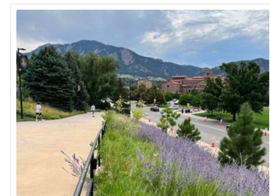
Photo of CU's campus. It is a really beautiful campus with so much potential.

ago that he had taken some major steps towards positive change! Recently, he told me that he has been delving into the Bible quite a bit and has been asking some really good questions as well. This has been really encouraging and awesome to see and I want to say thanks a ton for all the prayers!