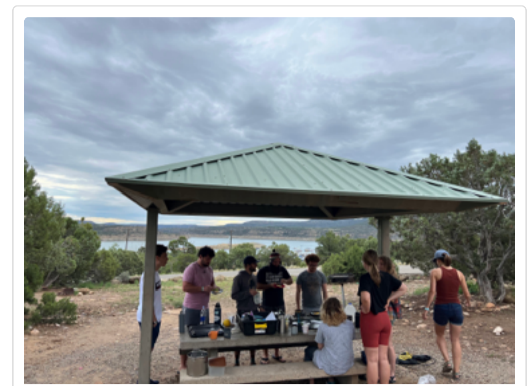
Morning breakfast during camping on the way back from CMC.

During this time they also talked about an organization called EveryCampus which is an interdenominational organization that is collaborating with a bunch of different campus ministry organizations with the goal of seeing a gospel community on every campus in the US. It was really awesome to hear about this organization and their vision for the campuses across the US.