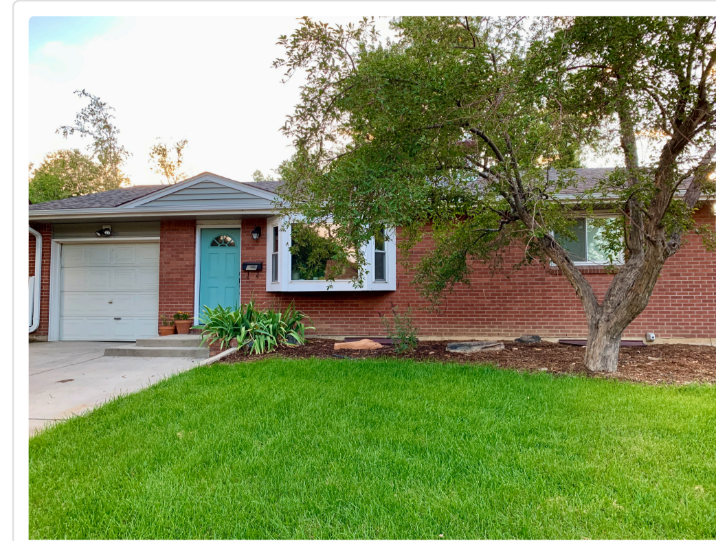
Our house in Boulder.