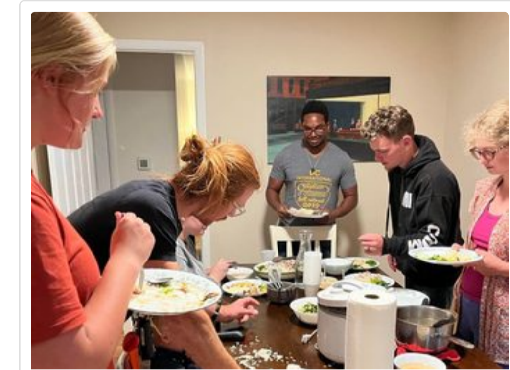
Having some students and people from our church over for dinner.

We have also gotten plugged into an awesome church down here in Boulder, more on that in a sec. We have met some really cool students through that church, as well. The students we have met at the church are part of other campus ministries at CU, but it has been really encouraging to talk to them and see that God is really moving on campus here and that there are other students that want to see change on this campus.