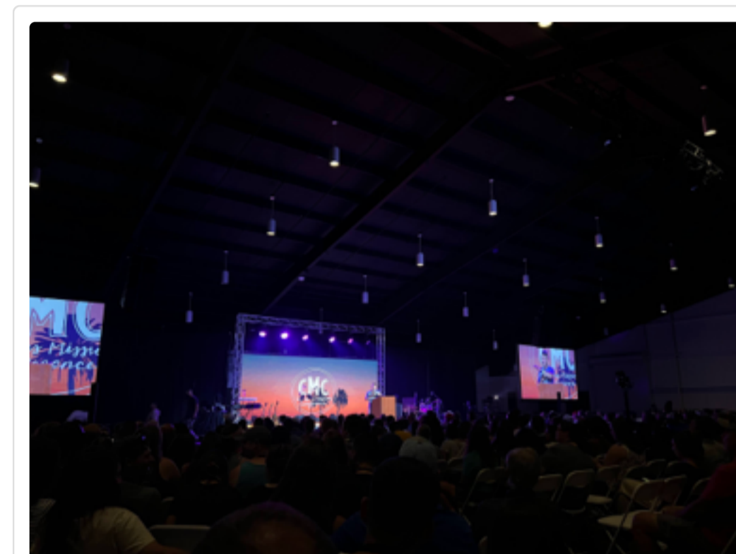
Photo from one of the sessions at CMC.

There were a lot of things covered over the week of CMC, but my favorites included a session on Holy Spirit Lead Pioneering, which was really good and pertinent to what I am helping to do in Boulder. The other sessions that I really enjoyed were on the importance of unity in the Body of Christ. I thought this was particularly cool, because sometimes in campus ministry there can be a little bit of competitiveness among the different campus ministries for students on campus. It is always good to keep in mind that we are all fighting for the campuses we are on and all have a desire to see students lives changed by the Gospel of Christ.